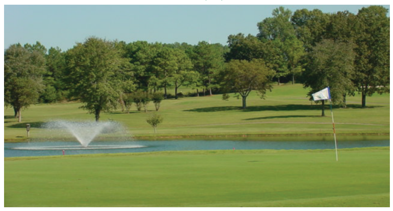
POLICIES, PROCEDURES, & GUIDELINES